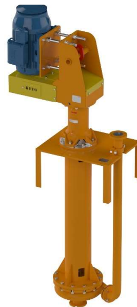
K-VTC3 Vertical Vortex Sump Pump Set